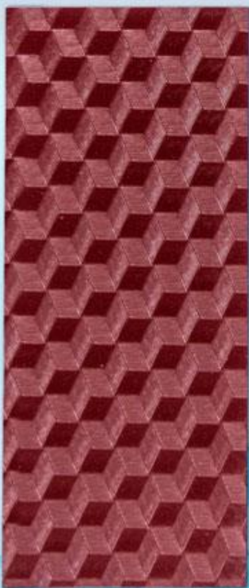
B 8118 / 3017