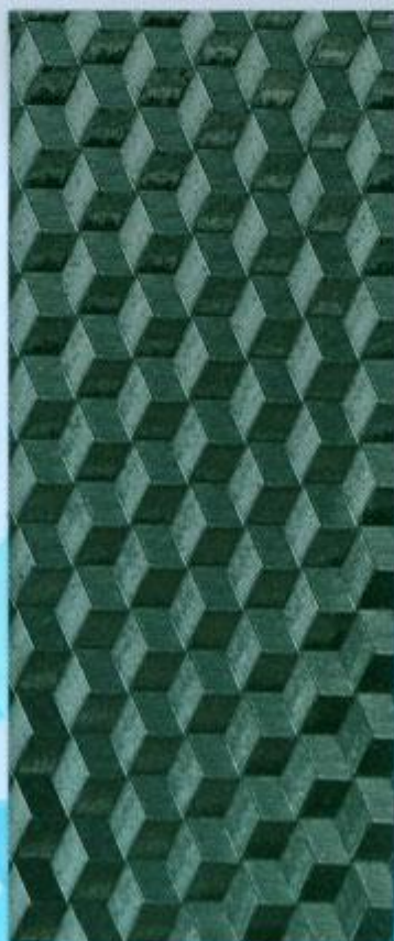
B 8118 / 6028